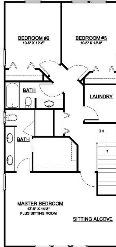
2ND FLOOR - 1045 SF